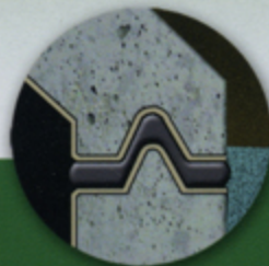
B DORIC INTEGRA-SEAL®