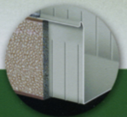
C HIGH IMPACT ABS LINER